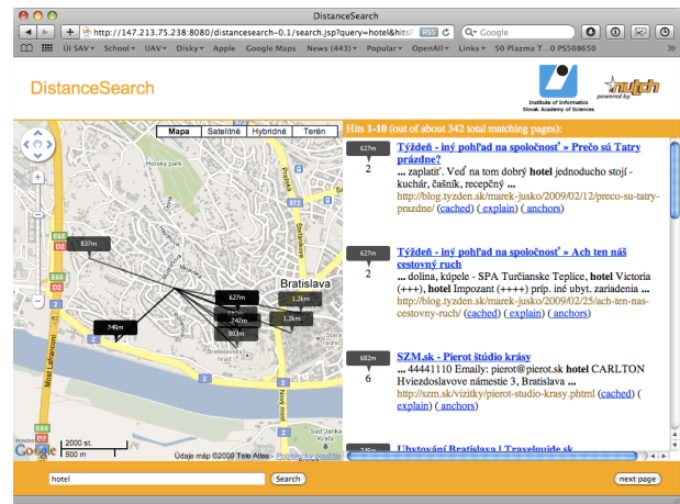
Figure 2. Search interface with map viewport on the left and search results on the right.